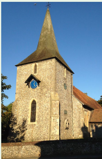
St Mary the Virgin church, Downe

Covered on Ordnance Survey Explorer 147 map