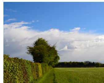
Nearing Point 3

downhill then reaches a hedgerow, goes over a stile, then down steps to a junction with a north-south path and signpost.