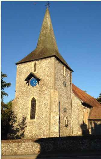
St Mary the Virgin church, Downe

Click here for GPX track of this route for real-time navigation