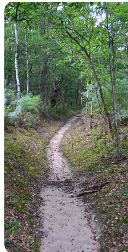
Sand path heading back to start after Point 5

This walk is one of several routes on the Greensand Ridge at KWNL; these are Ide Hill, Hosey Common, Westerham, and the nearby One Tree Hill and Underriver routes.